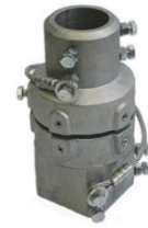
ROUND TO SQUARE