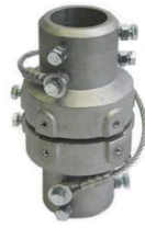
ROUND TO ROUND

Sign post breakaway system protects the post anchor in the ground from damage