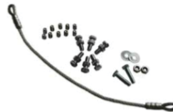
Fastener Kit - Complete For 1 Breakaway Coupling

Stainless steel and galvanized hardware extends re-usability of the cups