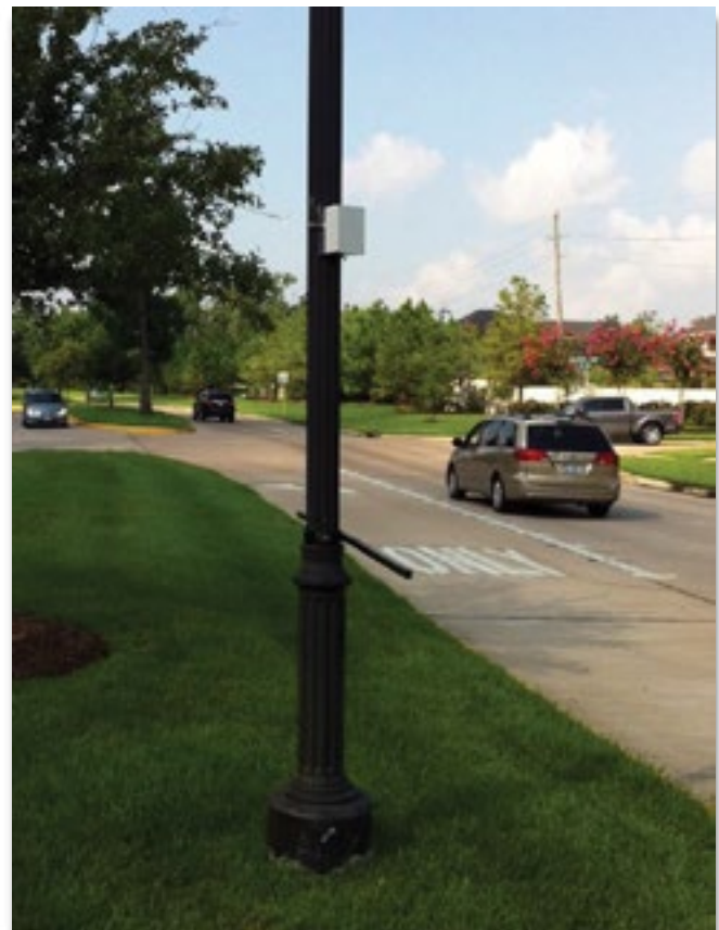
Armadillo mounted on light pole collecting data

2891 BoxSprings Link NW | Medicine Hat, AB T1C 0H3