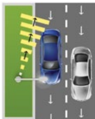
Armadillo on the side with 2 lanes incoming. No outgoing lanes can be detected