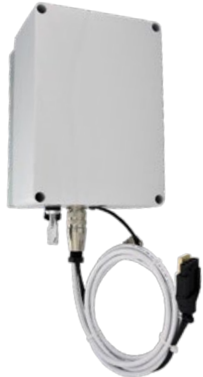
Armadillo Tracker Radar Stats Collector