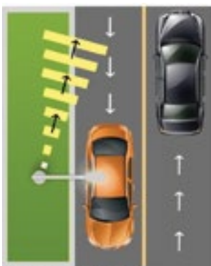
Armadillo on the side with 1 lane each direction